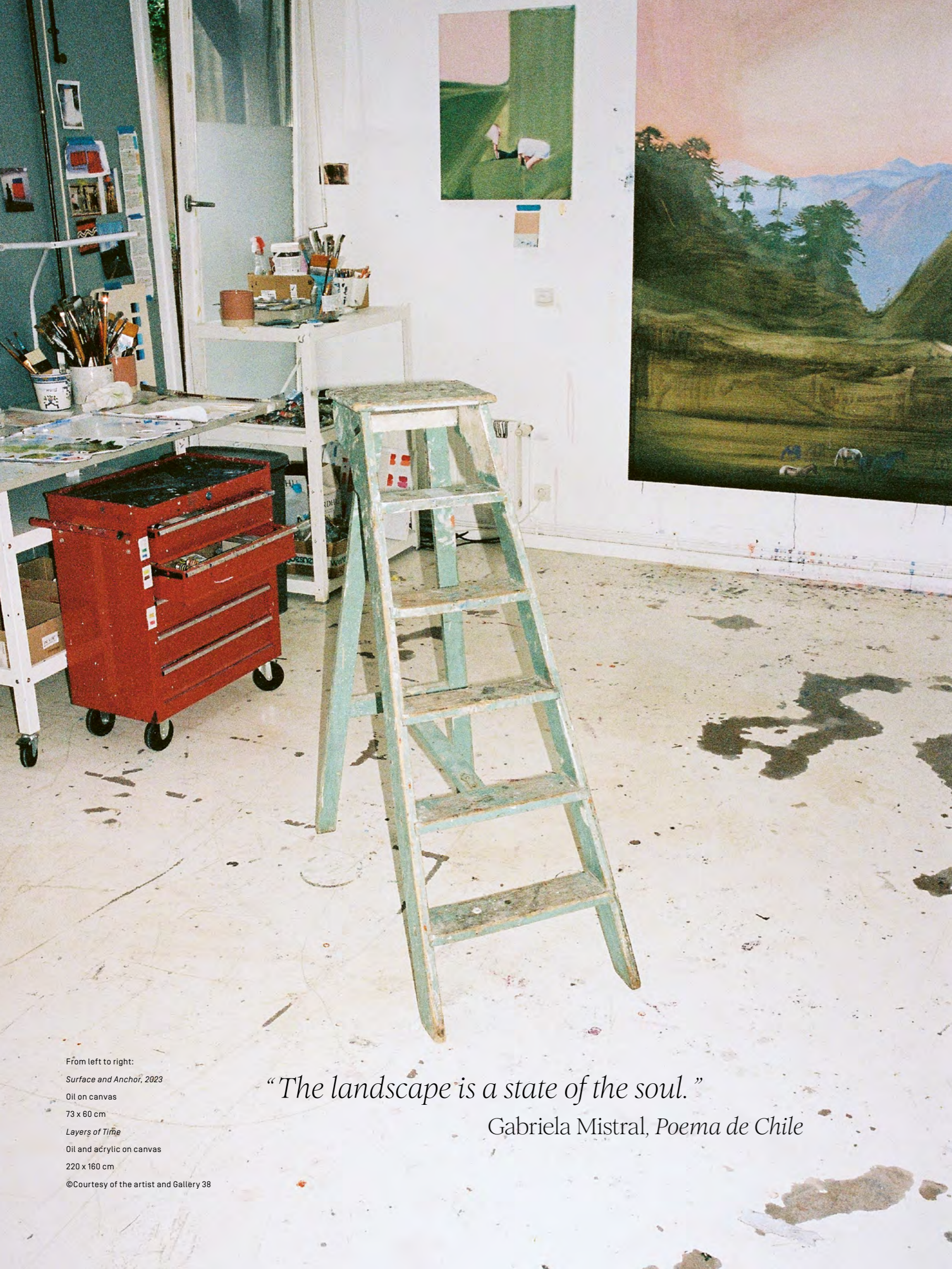
From left to right: Surface and Anchor , 2023 Oil on canvas 73 x 60 cm Layers of Time Oil and acrylic on canvas 220 x 160 cm ©Courtesy of the artist and Gallery 38

“The landscape is a state of the soul.” Gabriela Mistral, Poema de Chile