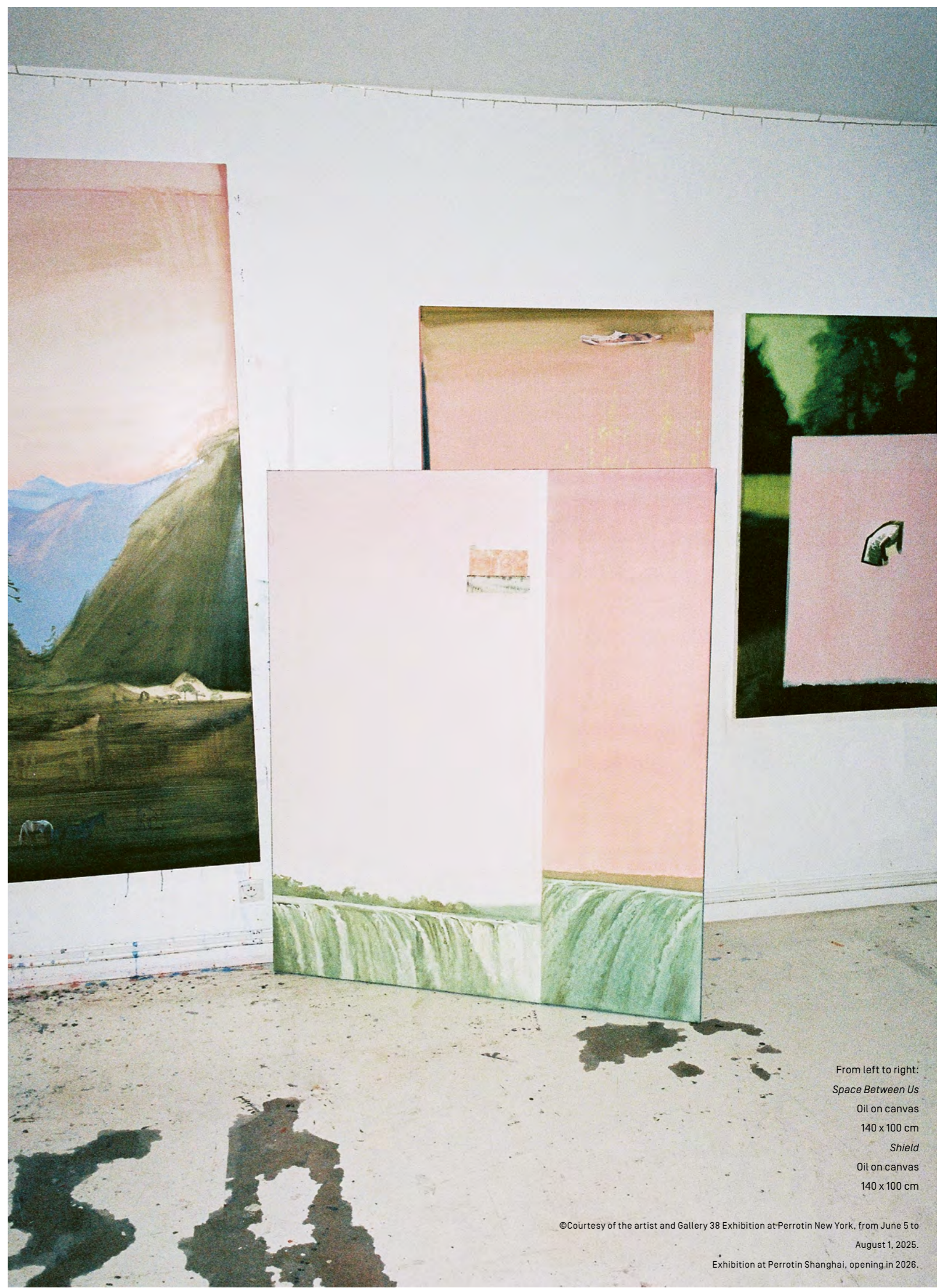
From left to right: Space Between Us Oil on canvas 140 x 100 cm Shield Oil on canvas 140 x 100 cm

“The landscape is a state of the soul.” Gabriela Mistral, Poema de Chile