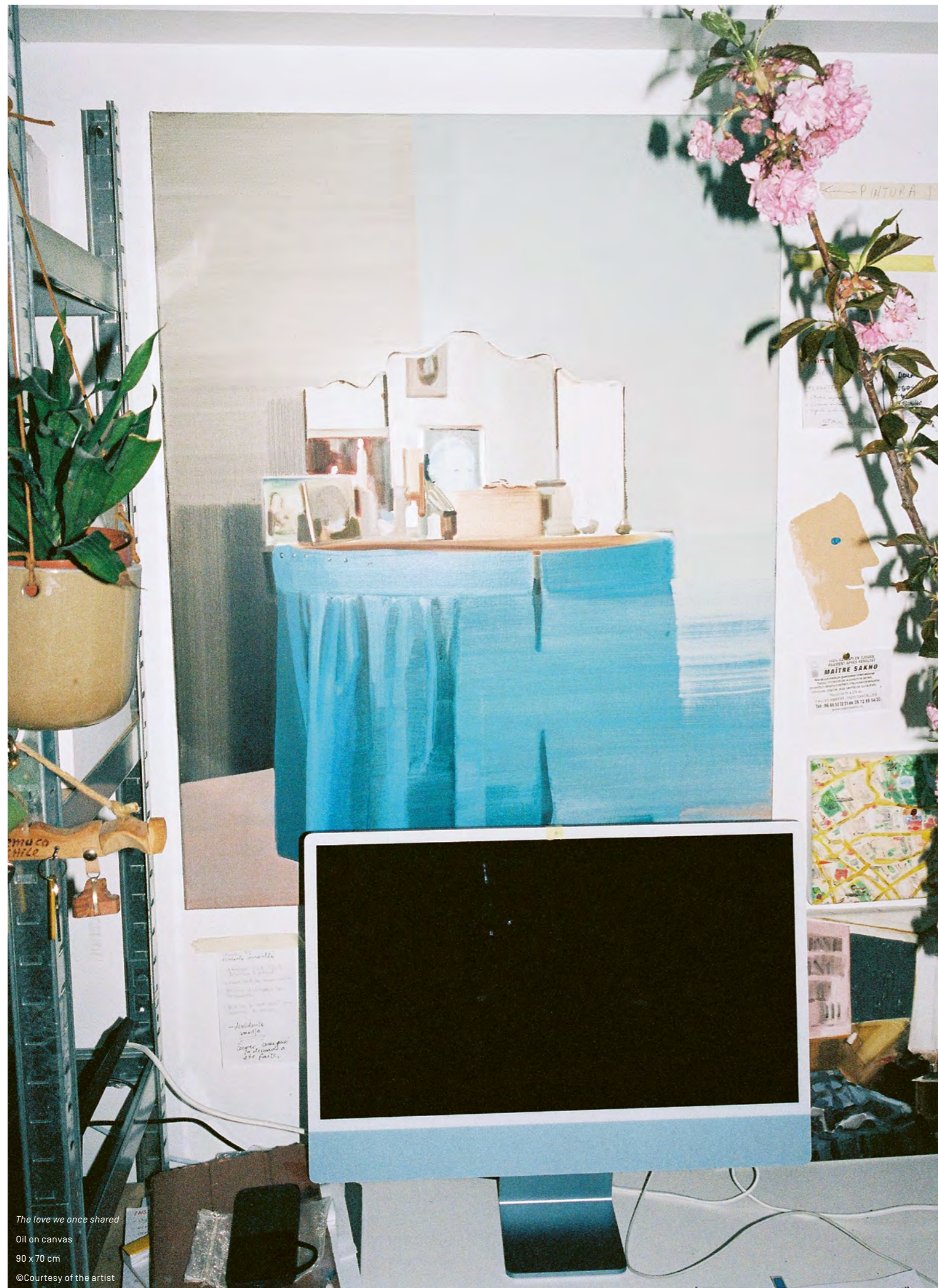
The love we once shared Oil on canvas 90 x 70 cm